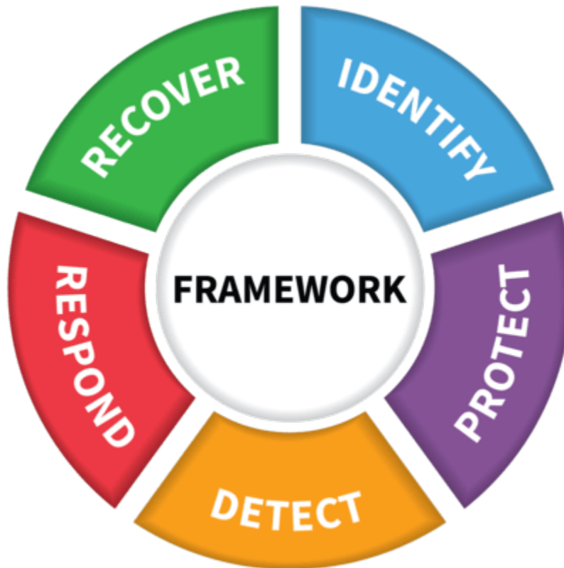
Figure 2: The Core of the NIST Cybersecurity Framework